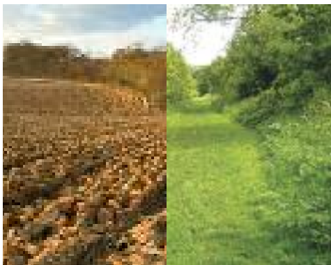
Bare land to woodland in just 12 years