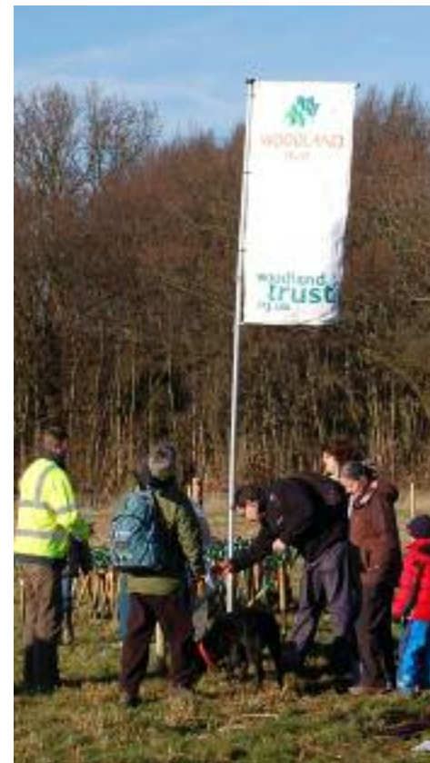
Join us at a Planting Day!